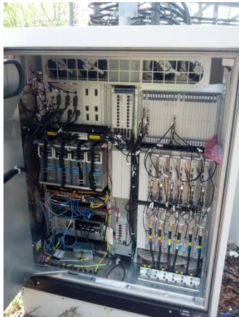
base station cabinet