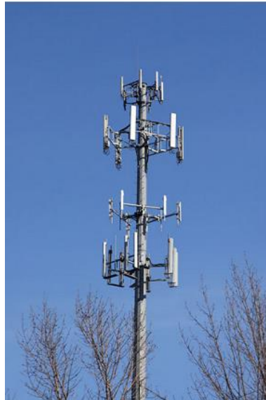
base station tower